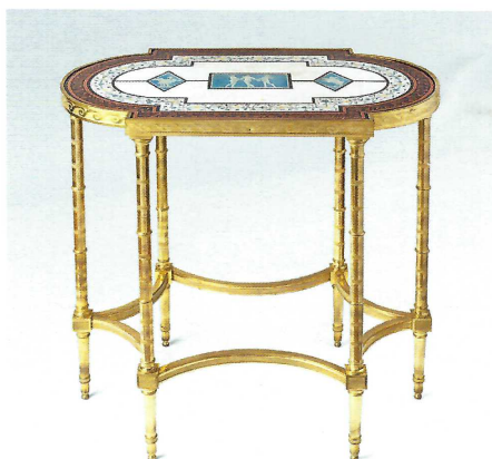
Oblong table , by Martin-Guillaume Biennais (1764– 1843). Moulded, chased and gilded bronze, inlaid French scagliola top, 71 by 72 by 45 cm. Artur Ramon Art, Madrid. Stand 253.