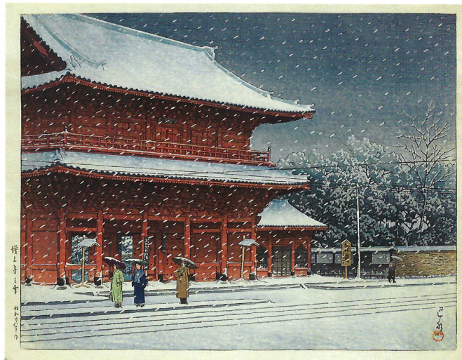
Snow over Zojoji Temple , by Kawase Hasui (1883–1957). 1953. Woodblock print, 36.4 by 47.3 cm. Galerie Tanakaya, Paris. Stand 615.