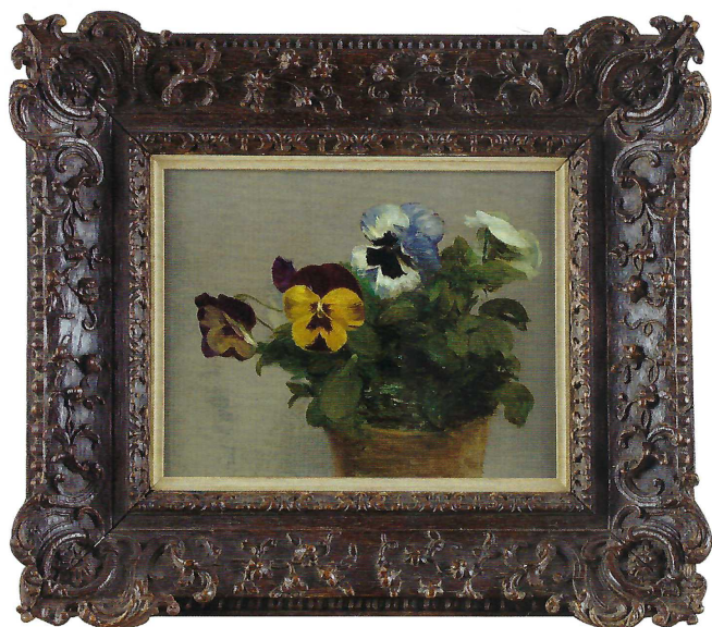
Potted pansies , by Victoria Dubourg (1840–1926). c.1870s. Oil on canvas, in original frame, 21 by 26.8 cm. Robilant+Voena, London and Rome. Stand 350.

For more details please visit: tefaf.com/fairs/tefaf-maastricht