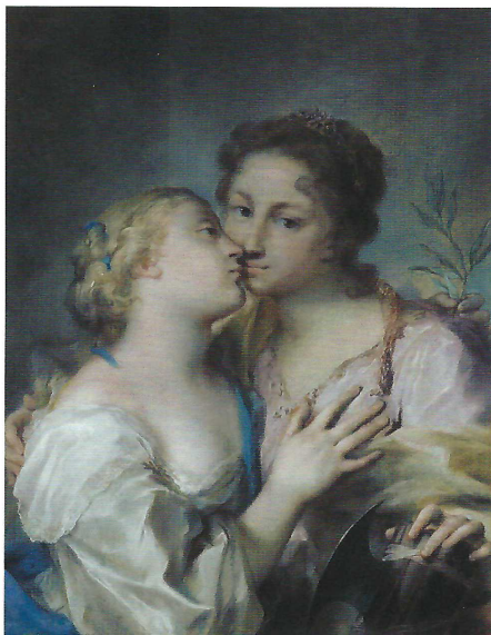
Peace and Justice (also known as Love and Justice ), by Rosalba Carriera (1673–1757). Pastel on paper, 63 by 54 cm. Brun Fine Art, London. Stand 176.